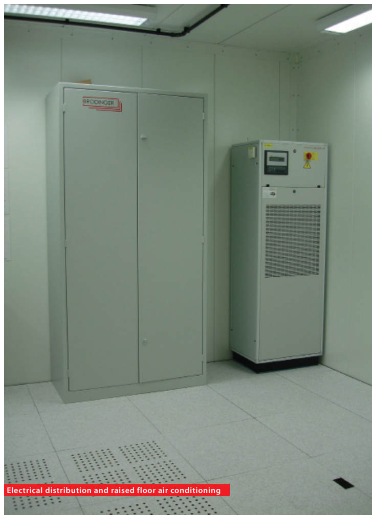
Electrical distribution and raised floor air conditioning

Customer Locations: Linz, Pasching, Austria