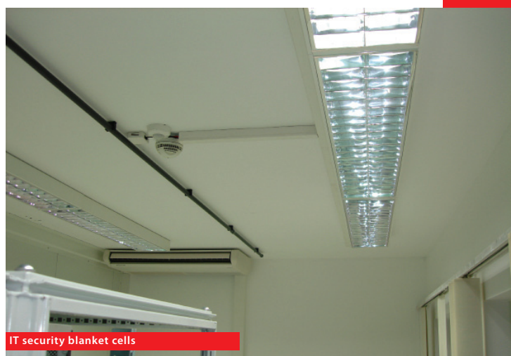
IT security blanket cells