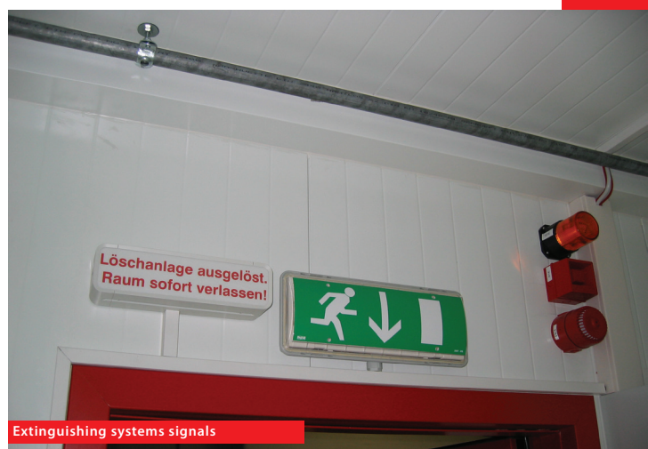
Extinguishing systems signals