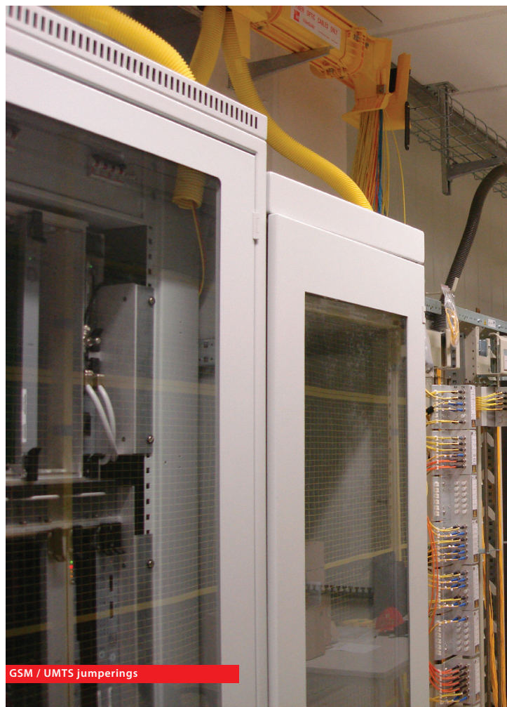
GSM / UMTS jumperings