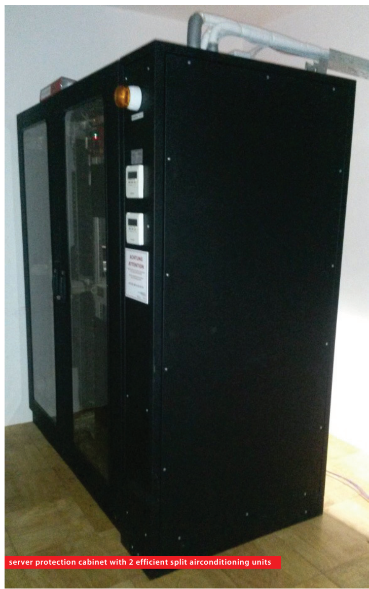
server protection cabinet with 2 efficient split airconditioning units