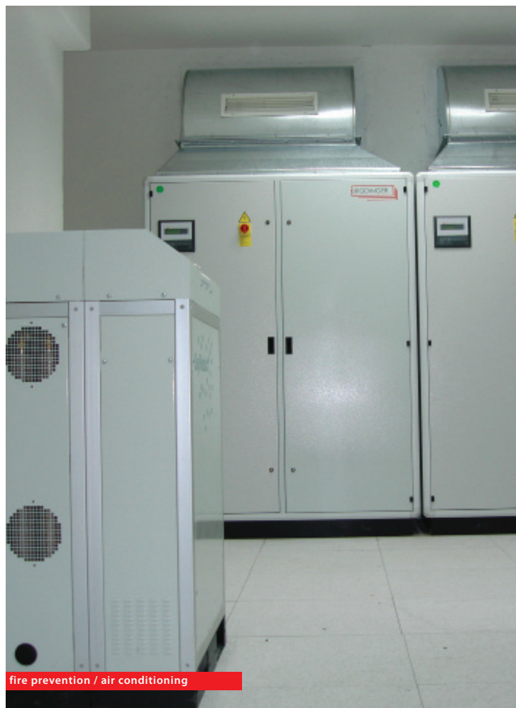
fire prevention / air conditioning