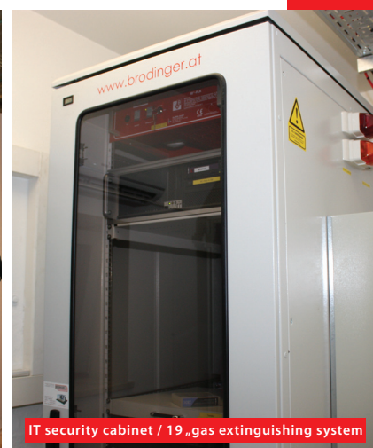
IT security cabinet / 19" gas extinguishing system