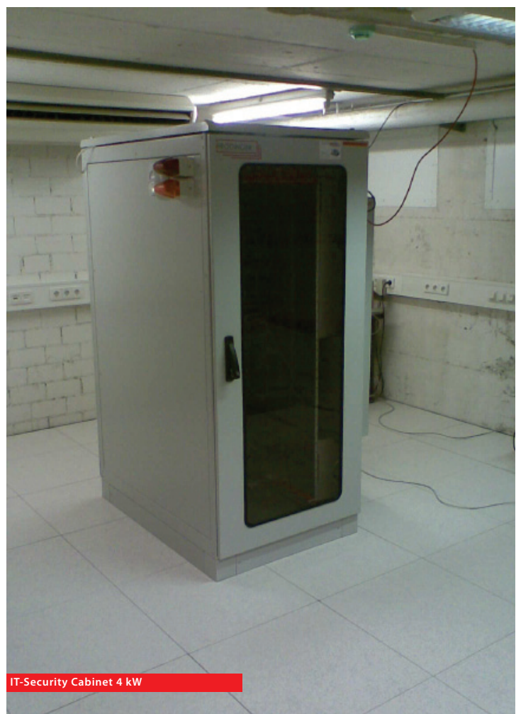
IT-Security Cabinet 4 kW