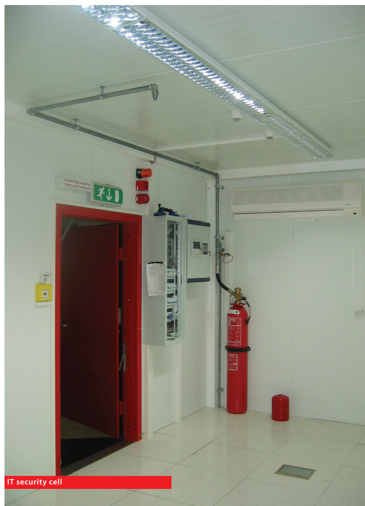
IT security cell