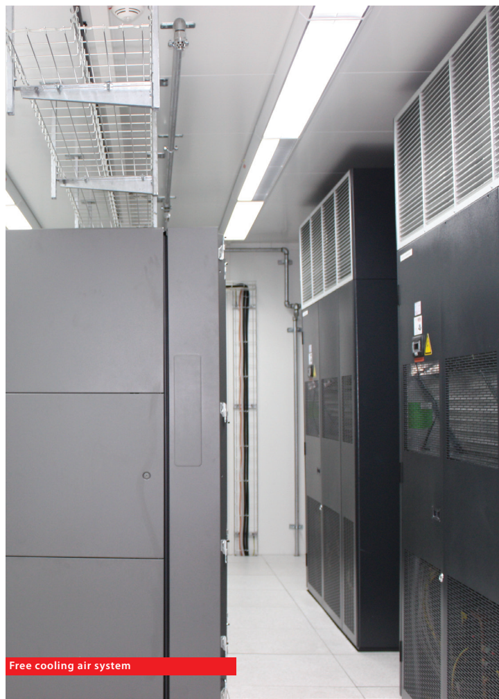
Free cooling air system