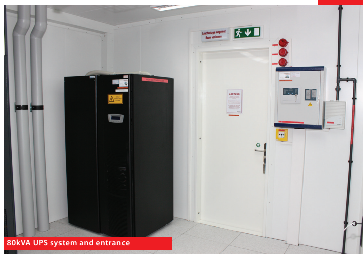
80kVA UPS system and entrance