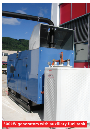
300kW generators with auxiliary fuel tank