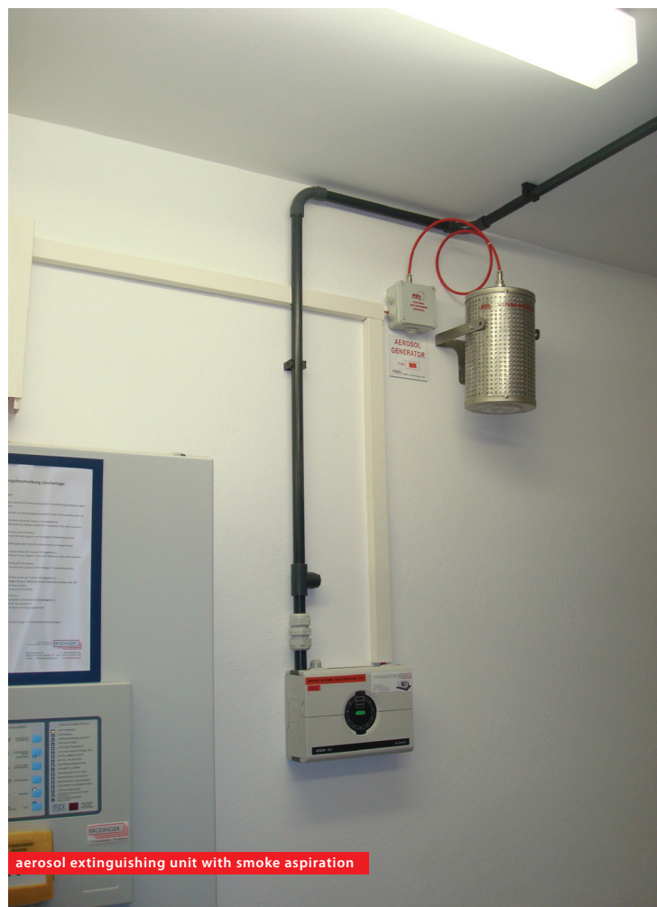
aerosol extinguishing unit with smoke aspiration