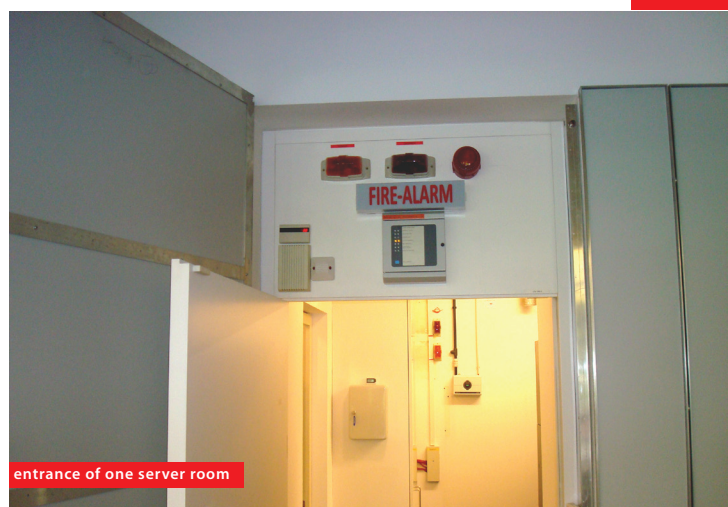
entrance of one server room

Customer location: Edlitz Thomasberg, Austria