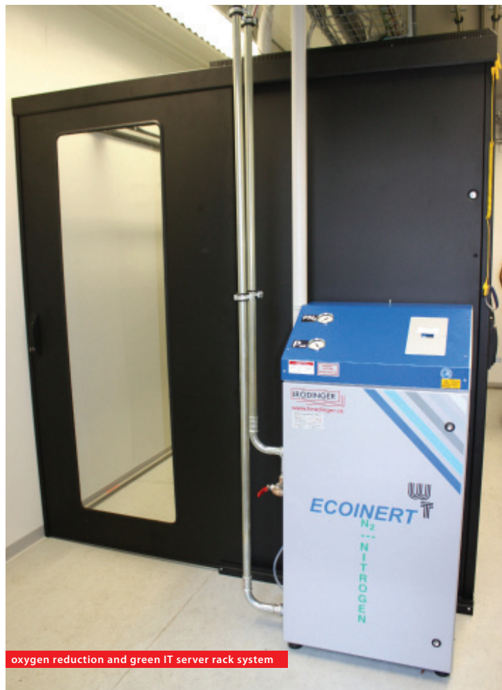
oxygen reduction and green IT server rack system