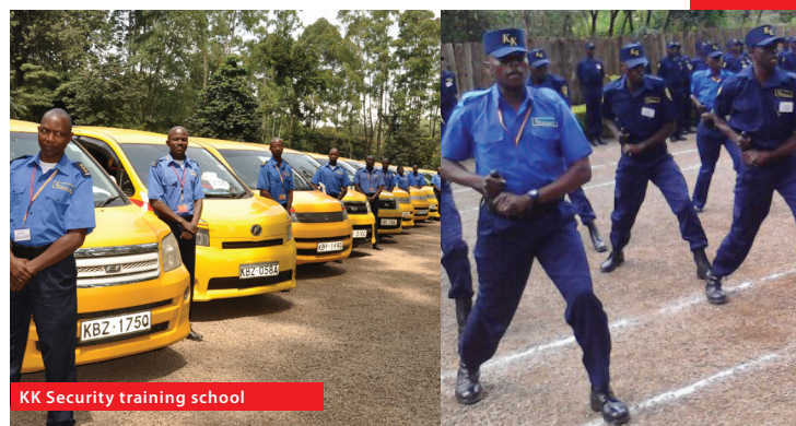
KK Security training school