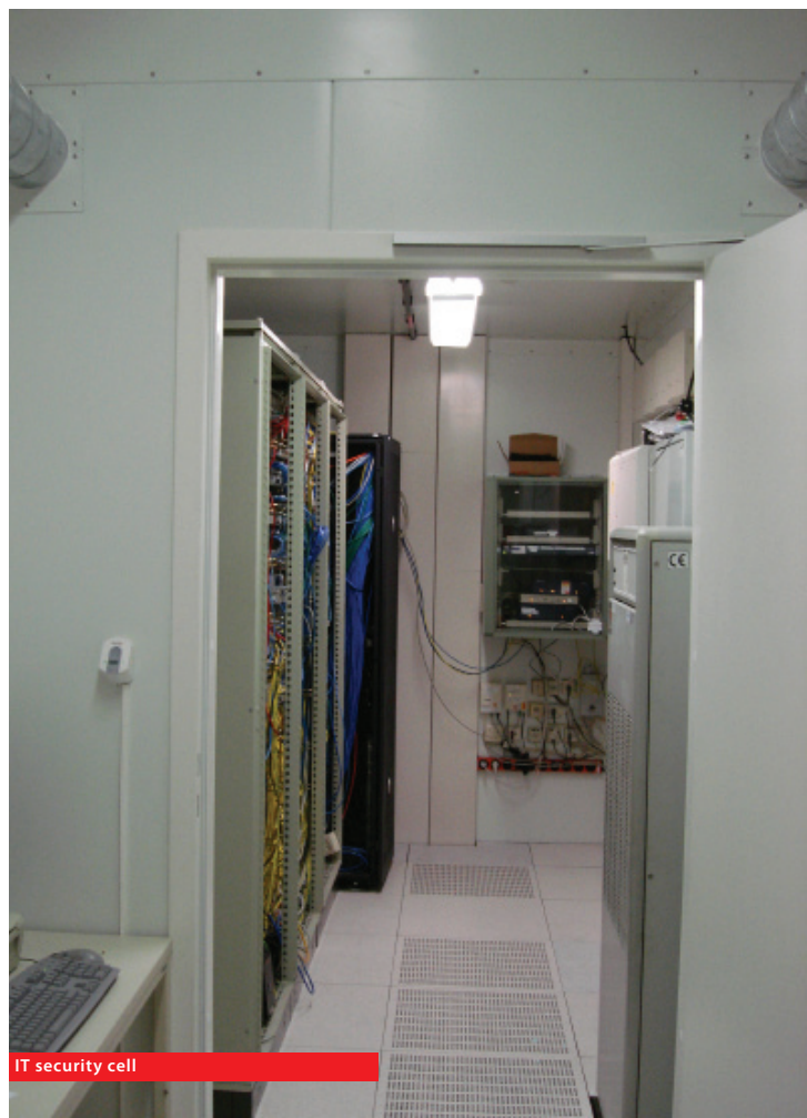
IT security cell